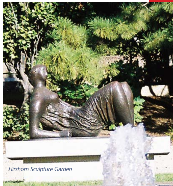
Hirshorn Sculpture Garden

www.nonpf.org and select “Register for 36th Annual Meeting” option under ACTIVITES section of Web site.