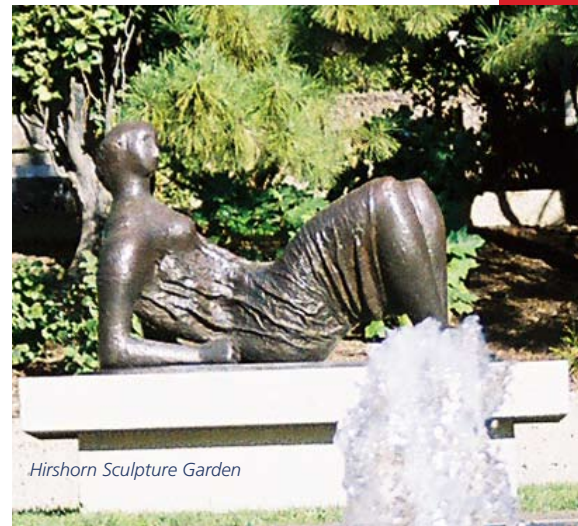
Hirshorn Sculpture Garden

www.nonpf.org and select “Register for 36th Annual Meeting” option under ACTIVITES section of Web site.